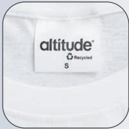
RECYCLED INNER LABEL

TS-AL-60-A IS AVAILABLE IN THE 4 COLOURS SHOWN ON THIS PAGE