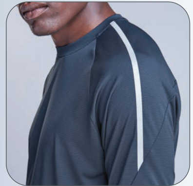
PANELLED RAGLAN SLEEVES WITH REFLECTIVE DETAIL