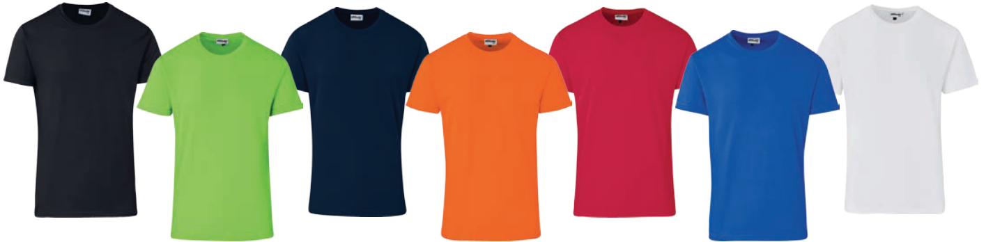
ALT-ASMS, ALT-ASLS & ALT-ASKS ARE AVAILABLE IN THE 7 COLOURS SHOWN ON THIS PAGE